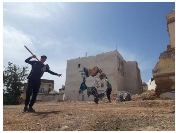
Members of a local association (under the government initiative Awarash) clearing the grounds