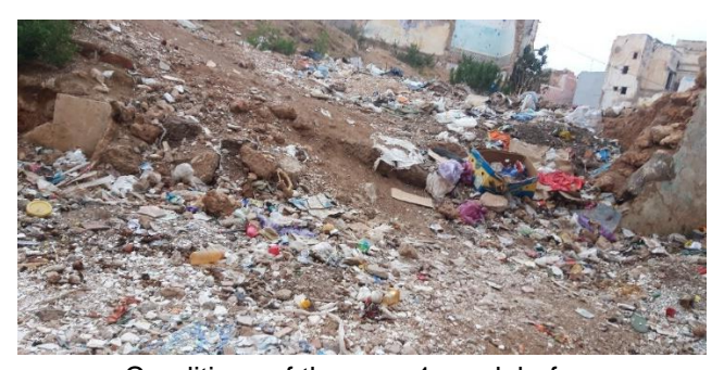
Conditions of the area 1-week before the creation of Sho'las mural

Three months after the creation of 'The Meeting Point' a local medina association, in partnership with the Government program Awarash, are further cleaning up and flattening the ground directly beneath the mural, to transform it into a community football pitch.