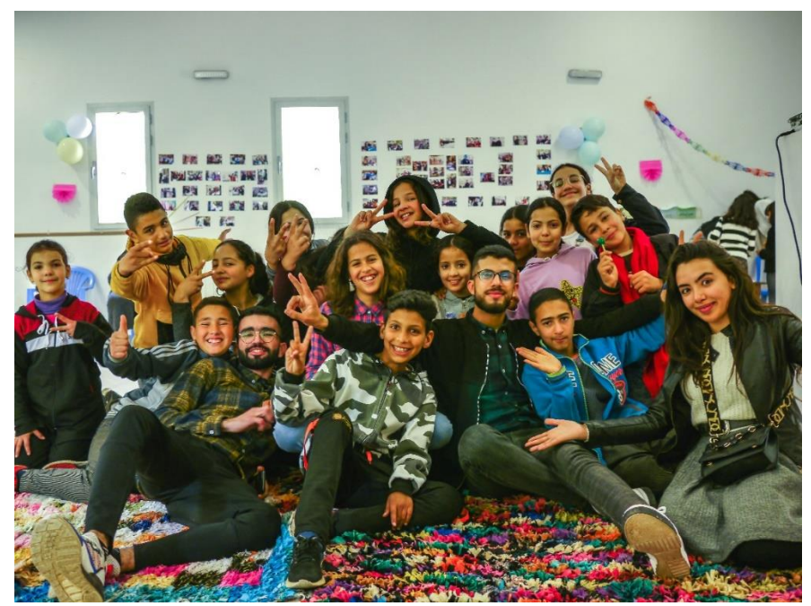
Some participants in one of Project Sho'las community gatherings. Spring 2022 Parallel to the youth-groups collective exploration of their local heritage, SAMAs facilitators' built relations with the Mellah's street community. Through focus groups and evaluation

A community gathering was held between the youth participants, Association Masque and SAMA members where reflections and contributions were celebrated, alongside the execution of creative and playful evaluation activities. This event also gave opportunity for Sho'las youth participants to express their sense of community building and increase in awareness of the diverse cultural heritage through short filmed interviews.